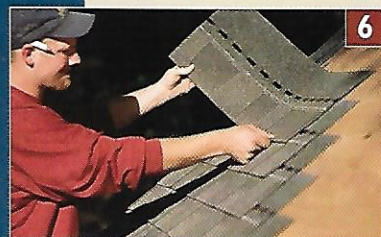
6 Roofing, p. 156