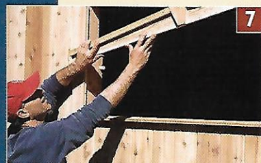
7 Windows and Exterior Trim, p. 160