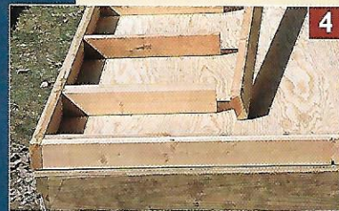
4 Walls, p. 147