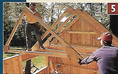
5 Roof Framing, p. 151