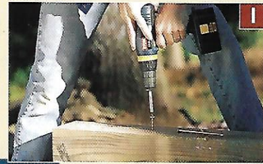
1 Skid Foundation, p.

This shed features vertical-board cedar siding, large 2-ft. by 4-ft. barn sash windows, and a pair of double-wide batten doors. The 10-in-12 roof slope is covered with architectural-style asphalt shingles. Note that the roof extends beyond each end wall by about 8 in. to create a gable overhang. This classic architectural detail, which is seldom found on storage sheds, emphasizes the gable roof and creates deep shadow lines at the end walls. (To order a set of building plans for the Colonial-Style Garden Shed, see Resources on p. 198.)