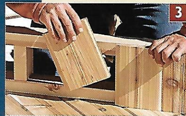
3 Gable-End Trusses, p. 145